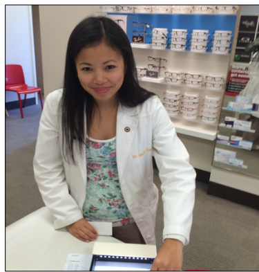
LuxIQ™ exam over eye chart