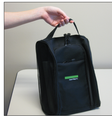
Convenient LuxIQ™ Soft Tote

Simply place the LuxIQ calibrated light source over reading material at a person's working distance. Move its sliders to vary the brightness (lux) and color temperature (°K). The lightweight, portable device enables lighting assessments in an office, home, school or lab. With its Light Bulb Calculator™ or LightChooser™ software, recommend commercially available optimum task lighting in < 5 minutes.